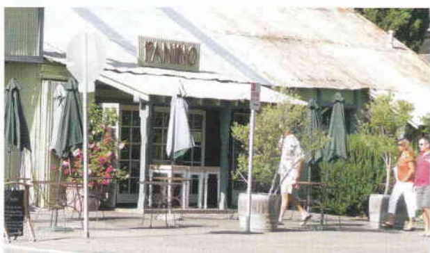
Above: take your Panino lunch to enjoy outdoors at Foley Estates